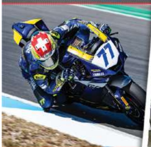
DOMINIC AEGERTER | TEN KATE RIDER 2021 WORLD SUPERSPORT CHAMPION